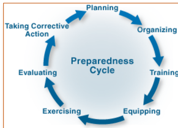
Figure 2: The RDPO's preparedness cycle is reflected above.